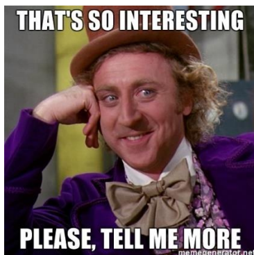
Fig. 2 Interesting